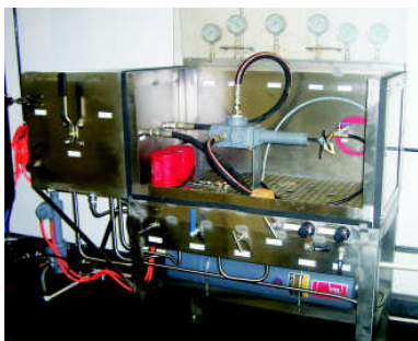
HI FLOW LO PRESSURE TEST STAND