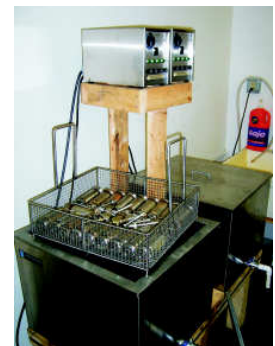
ULTRA SONIC CLEANING TANKS