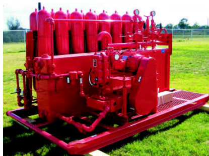
RETRO-FIT ACCUMULATOR UNITS